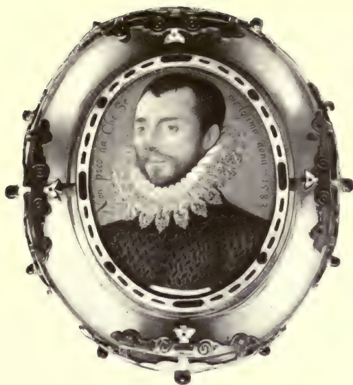
PHILIP II., KING OF SPAIN BY ISAAC OLIVER